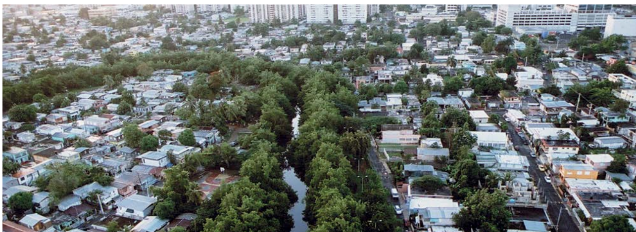
Communities around Caño Martín Peña

This brief is based on a peer-reviewed article that explores how “[managed] retreat – as both a concept and a practice – has the potential to change societal perceptions of climate risk, challenge techno-optimistic in situ adaptations, and foreground issues of equity as a primary concern in adaptation”. 2