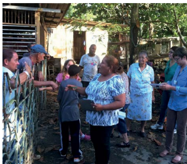
Relocation committee: residents supporting their neighbours in the relocation process