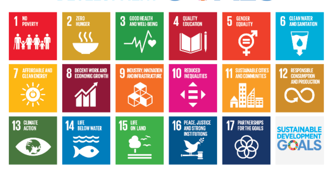
Figure 1: https://www.un.org/sustainabledevelopment/news/communications-material/