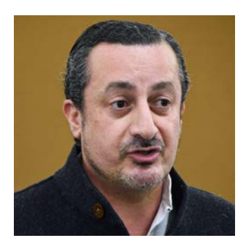
** Food is a political act. We're doing conflict resolution through cooking. ••