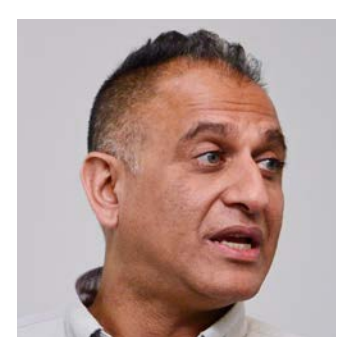
" We're working to build dynamic relationships that allow people to articulate what they want at a grassroots level. 9