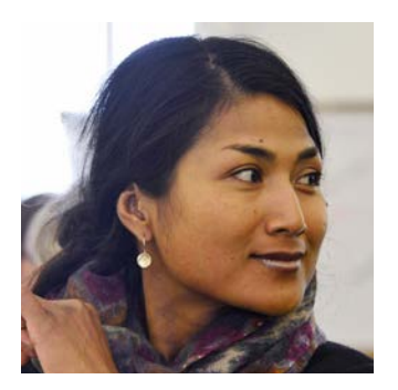
"Most of us are displaced – exiles in a sense – because we are disconnected from nature and the land. We have forgotten what we knew – the stories, the foodways, the fairy tales, and the inherent knowledge of self that is embedded in nature. 99