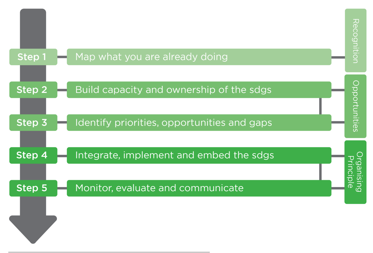
Figure 3: Overview of the step-by-step SDG integration process.

This Section provides guidance on Steps universities can take to start and to deepen their engagement with the SDGs. These Steps, which have been adapted from other guides<sup>i</sup>, are summarised in Figure 3 and are described in more detail below.